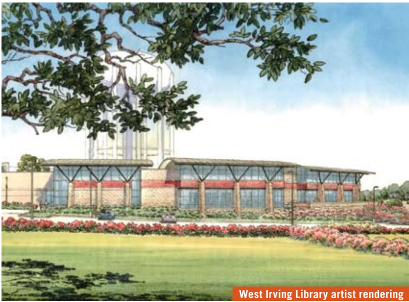
West Irving Library artist rendering