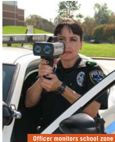
Officer monitors school zone