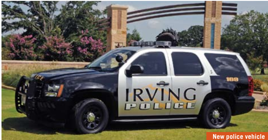
New police vehicle