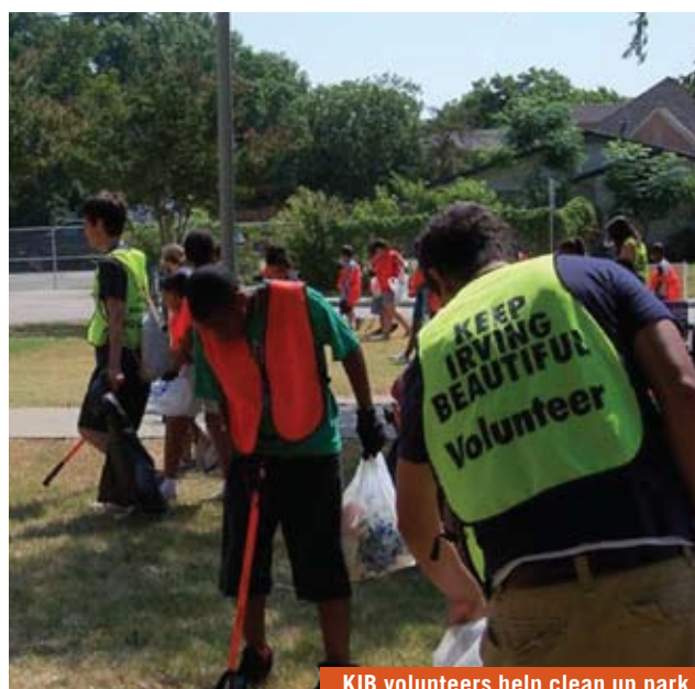
KIB volunteers help clean up park

This nonprofit, grassroots, leadership organization is dedicated to educating the community about litter abatement, recycling and beautification to help preserve environmental health, and promote social and economic prosperity. KIB is the award-winning local affiliate of Keep America Beautiful and Keep Texas Beautiful. To learn about volunteer opportunities visit www.keepirvingbeautiful.org , www.rockthegreen.org or call (972) 721-2175. ■