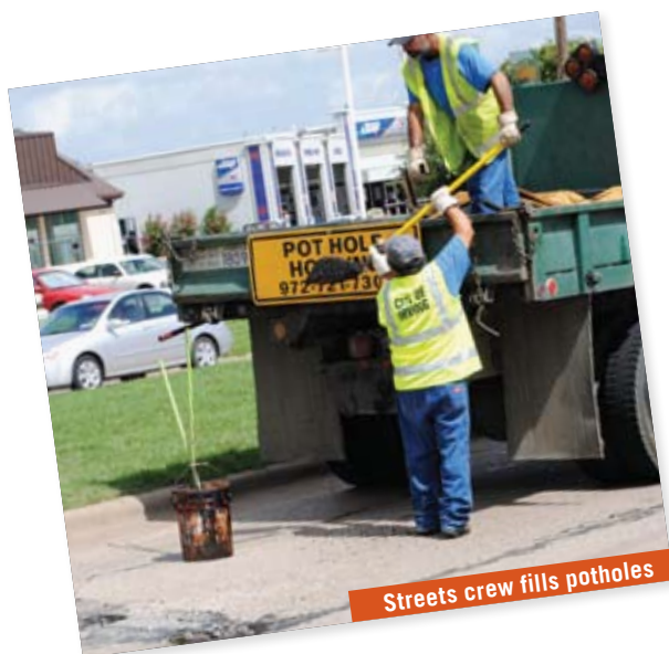
Streets crew fills potholes