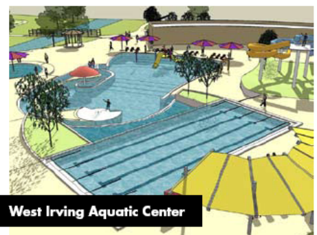
West Irving Aquatic Center

While much has happened during the past three years, more exciting infrastructure improvements are on the horizon. For more information on the city's capital improvement program, call (972) 721-2611.