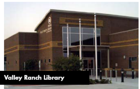
Valley Ranch Library

In West Irving, construction has begun on the West Irving Aquatic Center, and during Fiscal Year 2009-10, construction will begin on the West Irving Library. In Central Irving, construction continues on the Irving Convention Center and other development along the DART Orange Line. In addition, construction will begin on a new Fire House No. 4. In South Irving, emphasis is being placed on corridor enhancements along Irving and MacArthur boulevards.